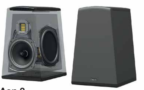
Aon 3 $1,250/pair