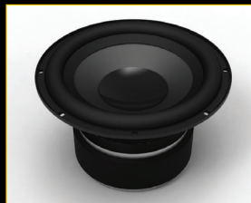
Ultra-Long-Throw Sub-Bass Driver